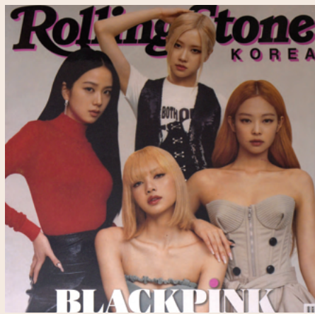
Rolling Stone magazine, Korea, July 2022 MoPOP Permanent Collection

Star Wars revolutionized the film industry with its groundbreaking special effects, epic storytelling, and immersive universe with iconic characters that have become deeply embedded in popular culture, transcending the realm of movies. It has spawned a massive franchise that includes multiple films, TV series, books, comics, video games, and merchandise. The franchise's influence can be seen in countless references, parodies, and homages across various media.