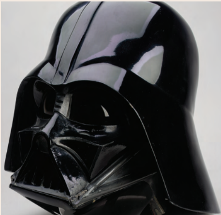
Darth Vader stunt helmet from Star Wars Episode V: The Empire Strikes Back , 1980 MoPOP Permanent Collection

Star Wars revolutionized the film industry with its groundbreaking special effects, epic storytelling, and immersive universe with iconic characters that have become deeply embedded in popular culture, transcending the realm of movies. It has spawned a massive franchise that includes multiple films, TV series, books, comics, video games, and merchandise. The franchise's influence can be seen in countless references, parodies, and homages across various media.