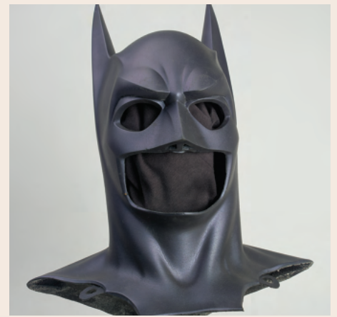
Batman costume worn by George Clooney in Batman & Robin , 1997 MoPOP Permanent Collection

Consisting of members Jisoo, Jennie, Rosé, and Lisa, the all-women K-Pop (Korean pop music) band was formed by YG Entertainment in 2016. They were not only the first female K-Pop group to perform at a U.S. festival, the Coachella Valley Music and Arts Festival in 2019, but the first Korean group to headline the same festival (2023). K-Pop is now a distinctive mainstream genre with celebrity status idols, addictive musical hooks, and precise choreography. BLACKPINK is part of the South Korean wave of artists, musicians, films, fashion, and more that have become a driving force of global pop culture.